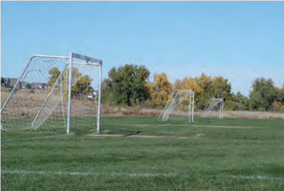
Figure 13A: Parker Land Use, 2010